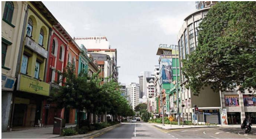
Businesses which provide services are among the most impacted by the movement control order and in need of relief.

Provided for client's internal research purposes only. May not be further copied, distributed, sold or published in any form without the prior consent of the copyright owner.