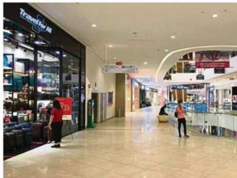
Some tenants of shopping centres operated by Sunway Malls have been given a full waiver on rental.

Tenants of commercial premises seek rental waiver but landlords say they too have costs to bear