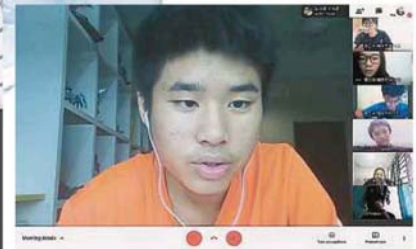
学记在网络营会也玩小游戏 (station game)，因为站长在讲解游戏玩法。