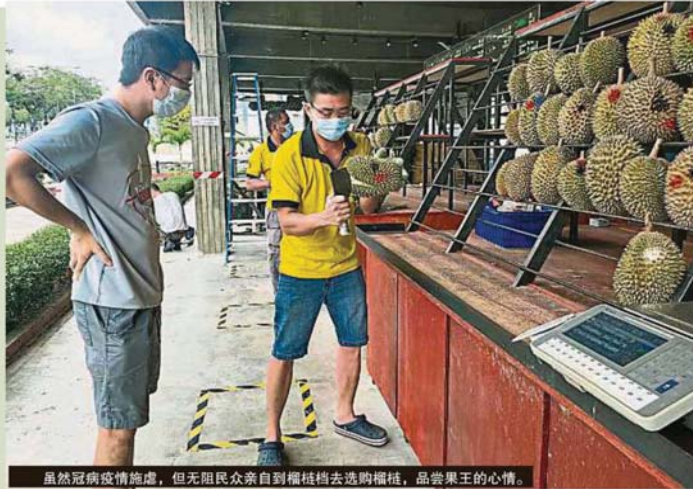
虽然冠病疫情肆虐, 但无阻民众亲自到榴槤档去选购榴槤, 品尝果王的心情。

自从雪州落实有条件行动管制令后, 灵市SS2商业区的榴槤档陆续恢复营业, 准备迎接榴槤季节的到来, 并让雪隆区的老饕们在疫情期间仍有机会品尝到美味的榴槤。