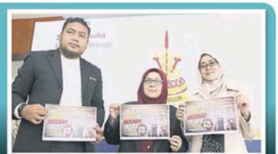
雪州政府自去年推行“寻找及扑灭”运动,以结合各道力量来对抗骨痛热症。

尾随在后的是成为热点区129天,就累计36宗病例的MENTARI COURT,以及成为热点区101天的武吉皇冠城6/B路(JALAN BM 6/B),累计51宗病例。