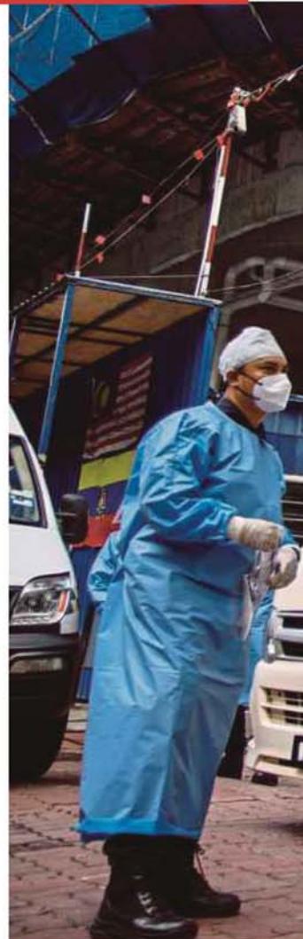
Health workers, with the help of policemen, taking workers from a construction site in Kuala Lumpur to a quarantine centre yesterday.

Ismail Sabri said the government would not bow to critics