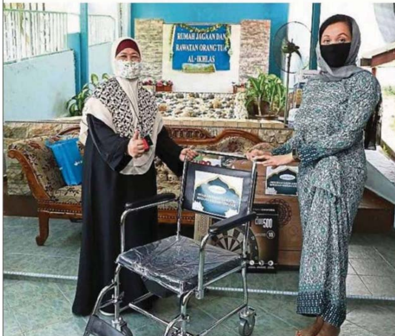
An Air Selangor representative presenting a wheelchair to a Rumah Jagaan & Rawatan Orang Tua Al-Ikhlas staff in Puchong.

In a statement, Air Selangor said it hoped the donations would help ease the homes' burden and put a smile on the residents' faces during the festive season.